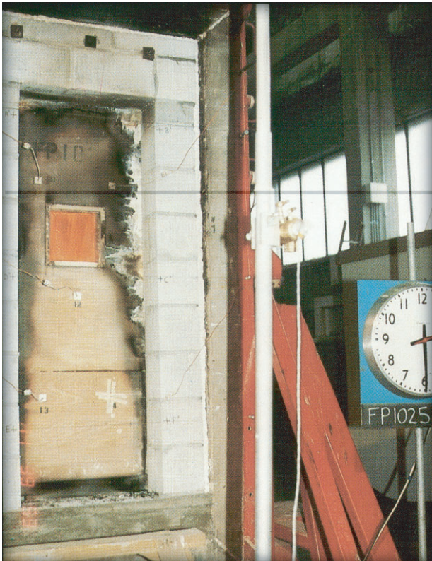
UDM sliding fire doors are available with vision panels of Pyroceram glass.