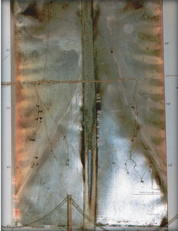
Bi-parting pair of 3600mm high sliding doors after 145 minutes of testing at BRANZ Laboratory.

Maximum Recommended Size – 3600mm x 3000mm (for larger openings refer to 5HR sliders)